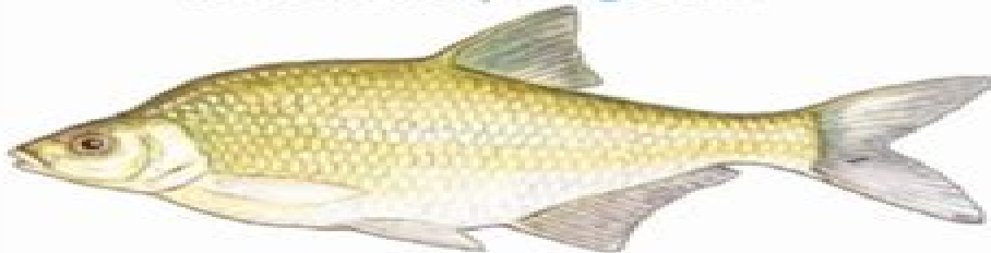
10. Bronze Bream Abramis brama Up to 80 cm