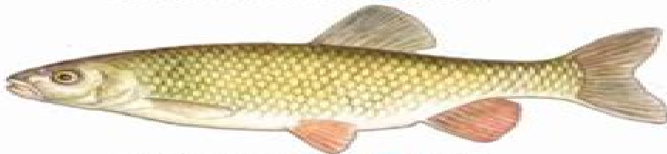
8. Chub Leuciscus cephalus 30-60 cm