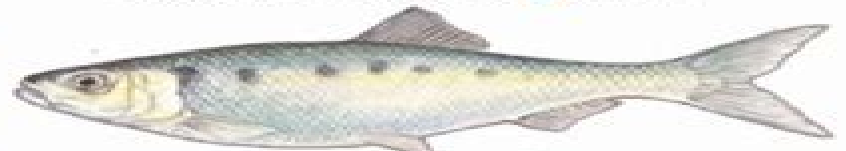
7. Twaité Shad Alosa fallax 25-40 cm