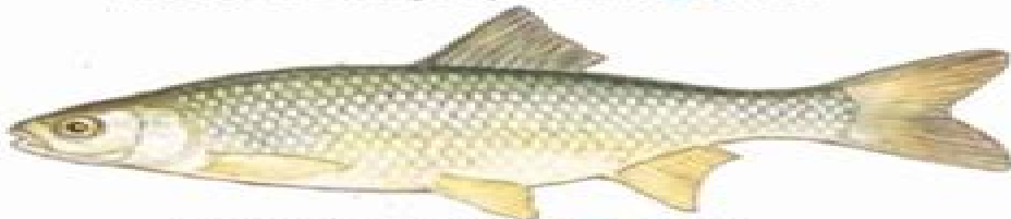
6. Dace Leuciscus leuciscus 20-30 cm