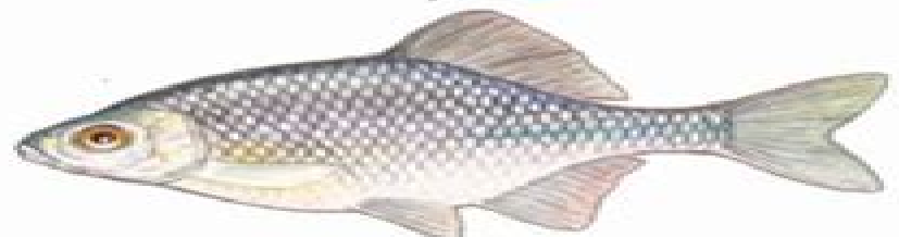
9. Bitterling Rhodeus sericeus 5-9 cm