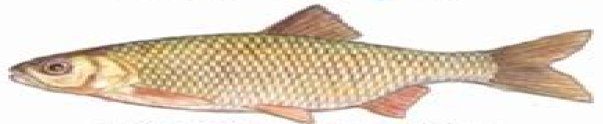
5. Orfe or Ide Leuciscus idus 30-50 cm