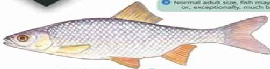
1. Roach Rutilus rutilus 20-45 cm

Normal adult size, fish may be smaller or, exceptionally, much bigger.