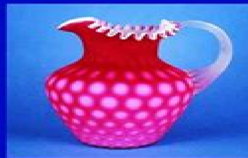
An Identification and Value Guide