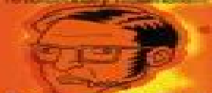
S A R T R E