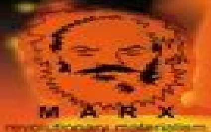
M A R X