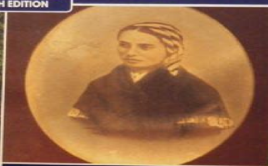
BERNADETTE SOUBIROUS the life and the apparitions