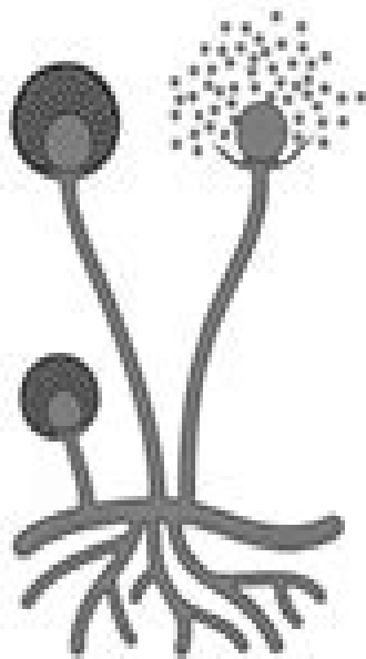
Rhizopus (Bread mold)

- classification, characteristics, structure and types