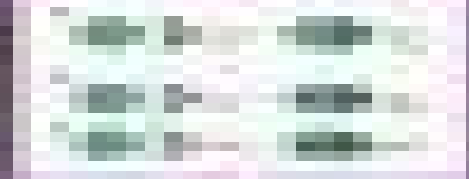
Figure 1.1: A series of images showing the structure of a cell. The images are arranged in a grid, with each image showing a different view of the cell. The images are labeled with letters A through F, and each image has a corresponding label below it.