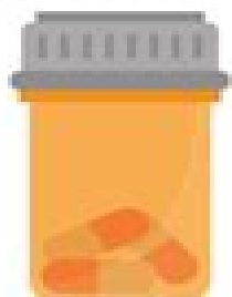
Over-the-counter pain relievers