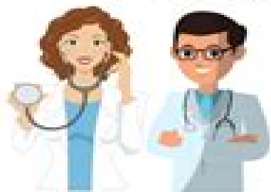
Consult with your Physician