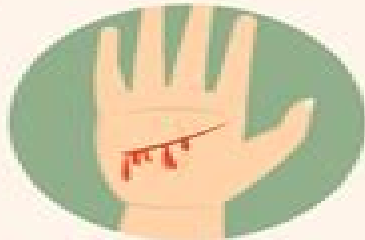
Punching, scratching, or pinching herself