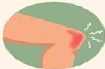
Giving herself intentional bruises