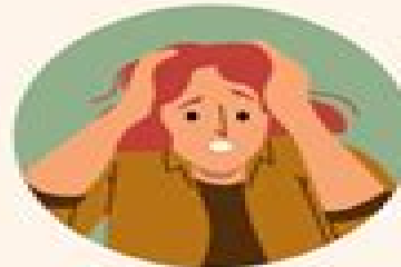
Pulling out her hair, eyelashes, or eyebrows