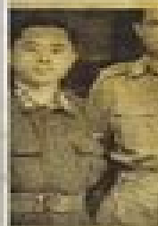
Small, dark, sepia-toned photograph showing two men in military uniforms standing side-by-side.