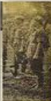
Small, dark, sepia-toned photograph showing a group of people in a wooded or jungle setting, possibly a military unit or a group of civilians.