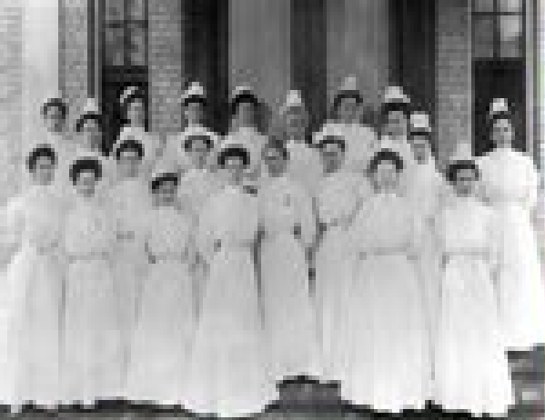
First Navy Nurse Corps Awarded in 1908