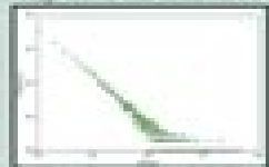
Without selective pruning

Degree distribution after 50% neurons of selective pruning without having gone through neuronal death (Heterocircuits)