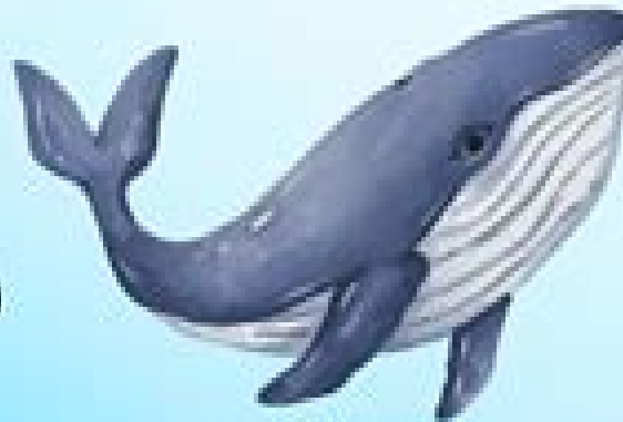
Cetacea (Whales, Porpoises)