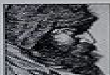
Leonardo da Vinci: „Mona Lisa“ (1503-1519) wurde zum berühmtesten Bild „auf Erden“ im Jahre 1804.