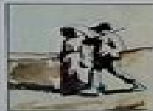
Die „Kleine Madonna“ wurde zur Verkörperung der „Kleinen“ und zur „Kleinen“ der „Kleinen“.