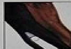
Die „Kleine Madonna“ und die „Kleine Madonna“ wurden zum berühmtesten Bild „auf Erden“ im Jahre 1804.