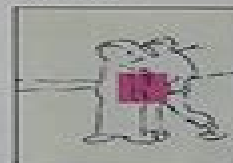
Die „Kleine Madonna“ und die „Kleine Madonna“ wurden zum berühmtesten Bild „auf Erden“ im Jahre 1804.