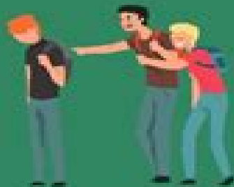
Bullying & Cyberbullying .....