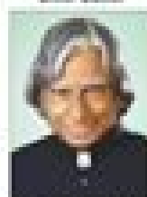
Dr. A.P.J. Abdul Kalam Former President of India