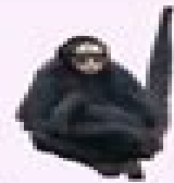
White-Cheeked Spider Monkey