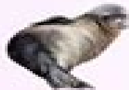
Hawaiian Monk Seal