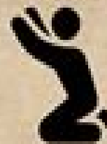
Souls Crying Out