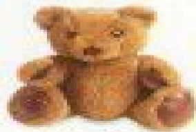
un osito one teddy bear