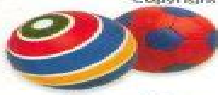
dos pelotas two balls