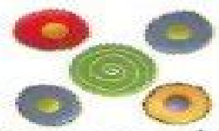
cinco pasteles five cupcakes