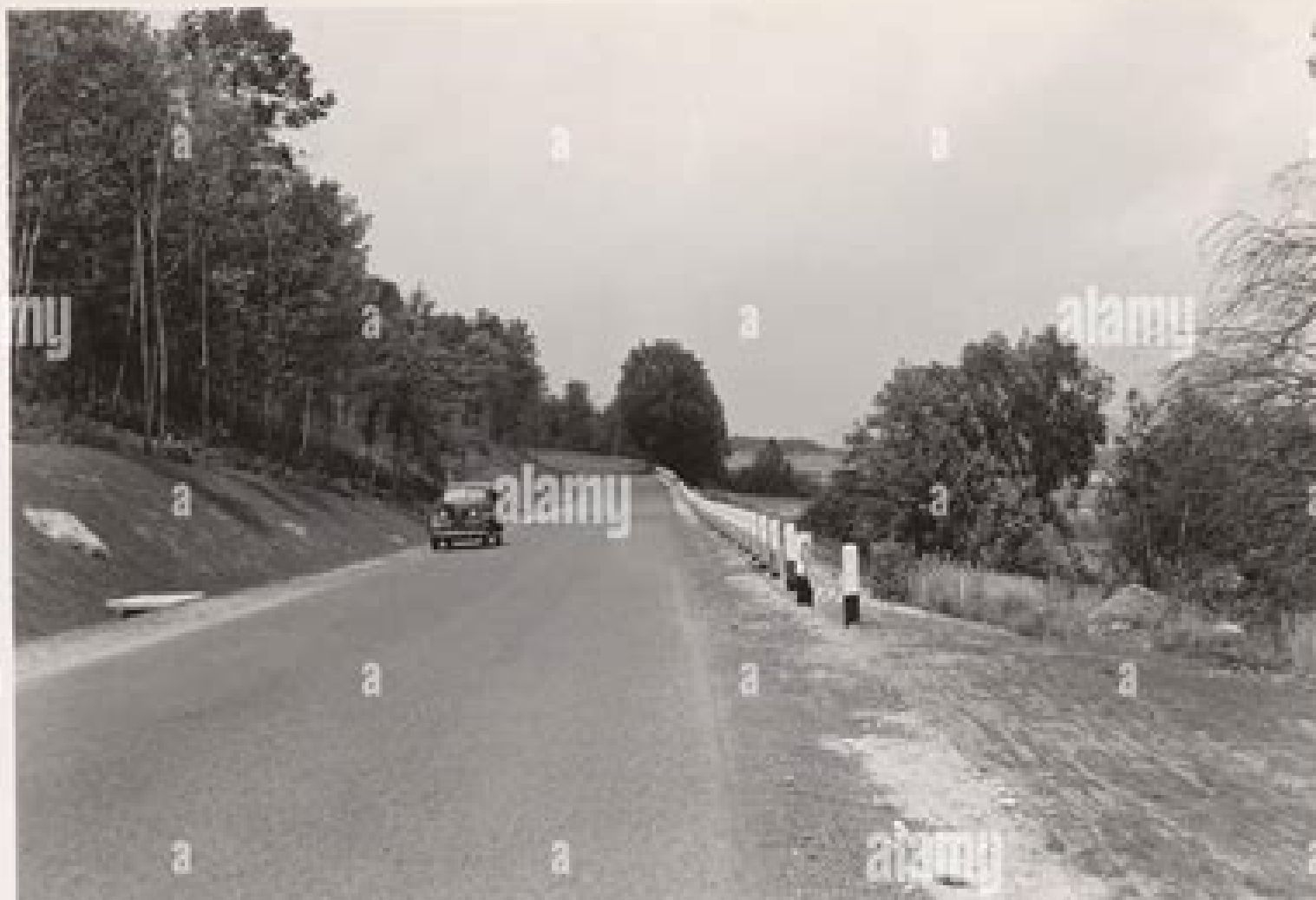
Looking Back from Sta. 199+50 ~ Quabbin Hill Road ~ Cont. 82 ~ 6-19-40 ~ (82) 194