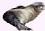
Hawaiian Monk Seal