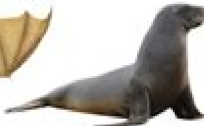
New Zealand Sea Lion