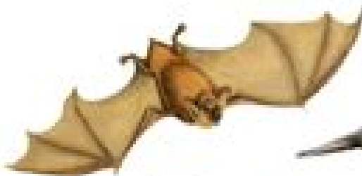
New Zealand Lesser Short-tailed Bat