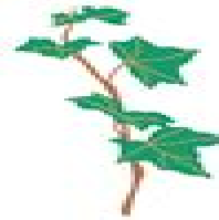
English Ivy ( Hedera helix )