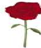
Rose ( Rosa spp.)