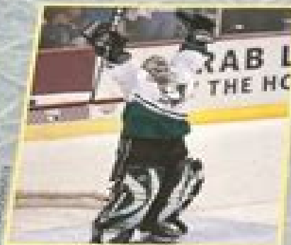
Left: The Conn Smythe Trophy-winning play of J-S Giguere sparked the Mighty Ducks to early-round playoff upsets. Giguere and his teammates finally were eliminated by New Jersey in game seven of the Finals.