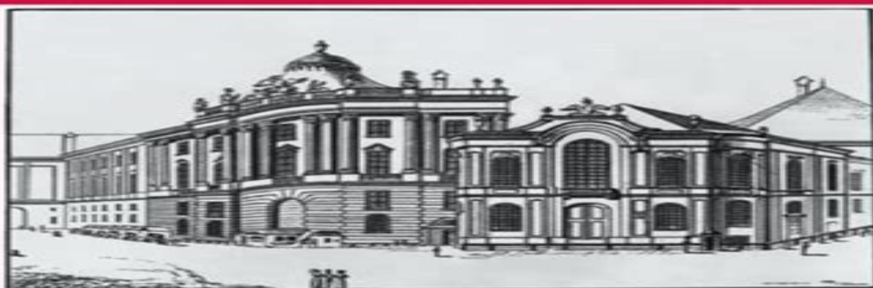
K.K. Burg Theater.