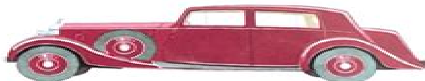
40/50 H.P. ROLLS-ROYCE