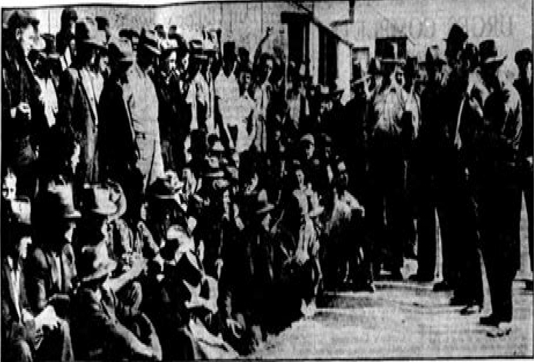
FINAL PICK-UP of outside workers at Wallingport yesterday before the "Dog Collar" Act was applied. The men firmly refused to load pig iron on the Duffman for Japan.