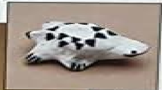
Apache Clay Turtle