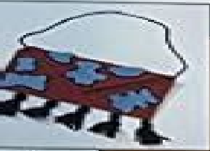
Shoshone Moccasin Bag