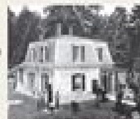
Lodge at City Point, Va., Jan. 1863. The first floor contained a cemetery office, and living rooms and kitchen for the superintendent's family. West Baltimore was opposite.

Most cemeteries were less than 10 acres, and layouts varied. In the Act to Establish and to Protect National Cemeteries of February 23, 1862, Congress funded new permanent walls or fences, grave markers, and lodges for cemetery superintendents.