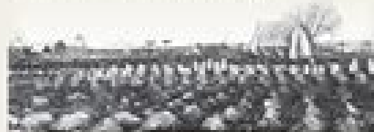
Soldiers' graves near General Hospital, City Point, Va., c. 1861. Library of Congress.

On September 11, 1861, the War Department directed commanding officers to keep "accurate and permanent records of deceased soldiers." It also required the U.S. Army Quartermaster General, the office responsible for administering to the needs of troops in life and in death, to mark each grave with a headboard. A few months later, the department mandated interment of the dead in graves marked with numbered headboards, recorded in a register.