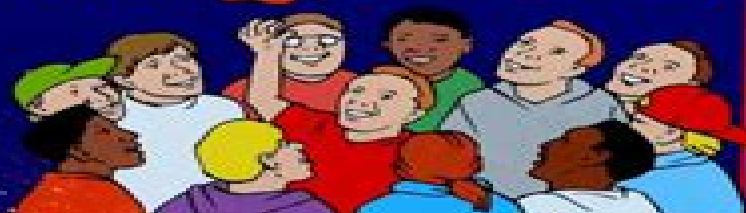
down the line