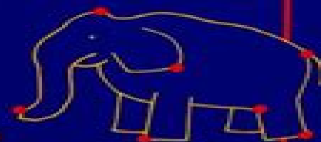
join the dots