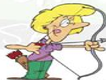
TIRO CON ARCO