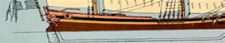
The Swedish postal ship «Hjorten», built at Karlskrone in 1692.