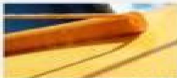
The solvent carries the paint from the container to the substrate, spread the paint, and allow the polymerization of the paint.