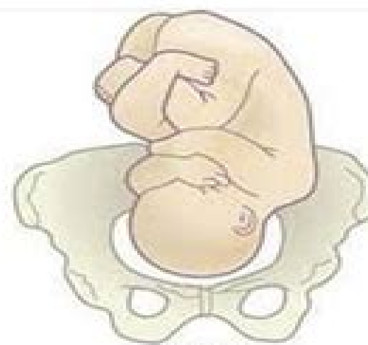
LOP Left occipitoposterior