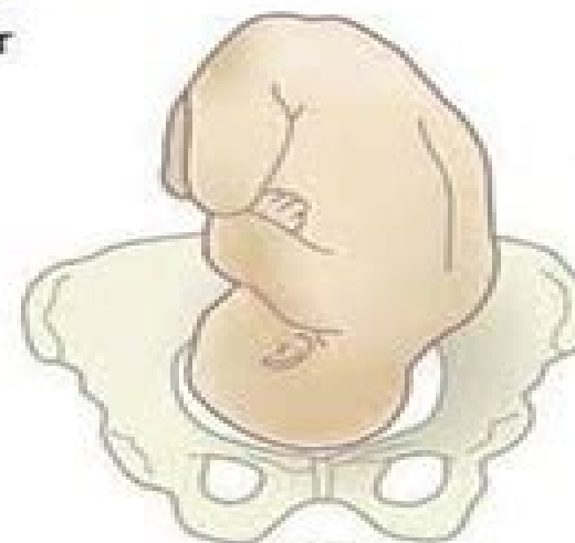
LOA Left occipitoanterior