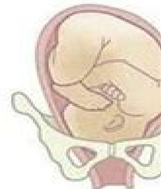
LOT Left occipitotran