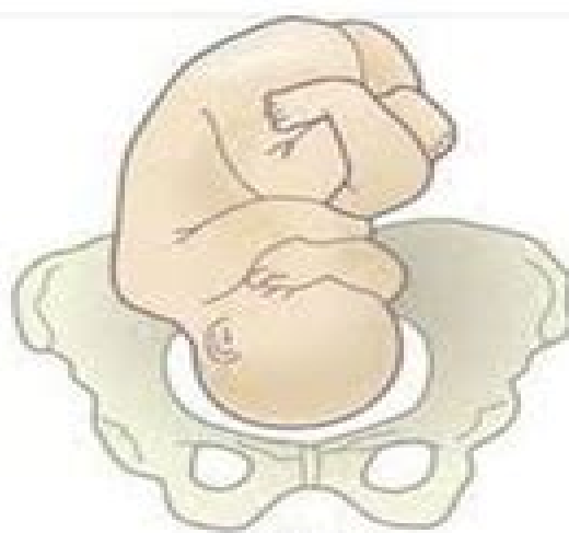
ROP Right occipitoposterior