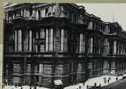
STOCK EXCHANGE BUILDING