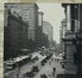
MADISON STREET CHICAGO'S MAJOR INTERSECTION 1900