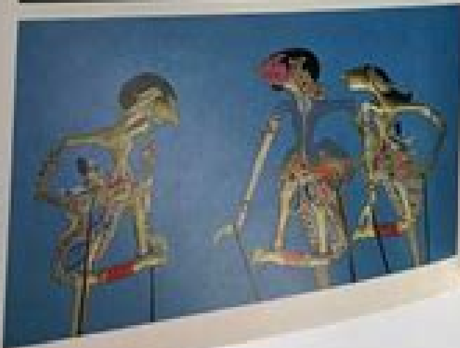
Top: Wayang Golek from Bali has a reputation of local fame. Middle: Wayang Kulit, created Department of Information to promote the struggle for independence. Bottom: Wayang Kulit, the puppets of which, made from deer heads, are used to tell the same historical legend of Hutanmelen.