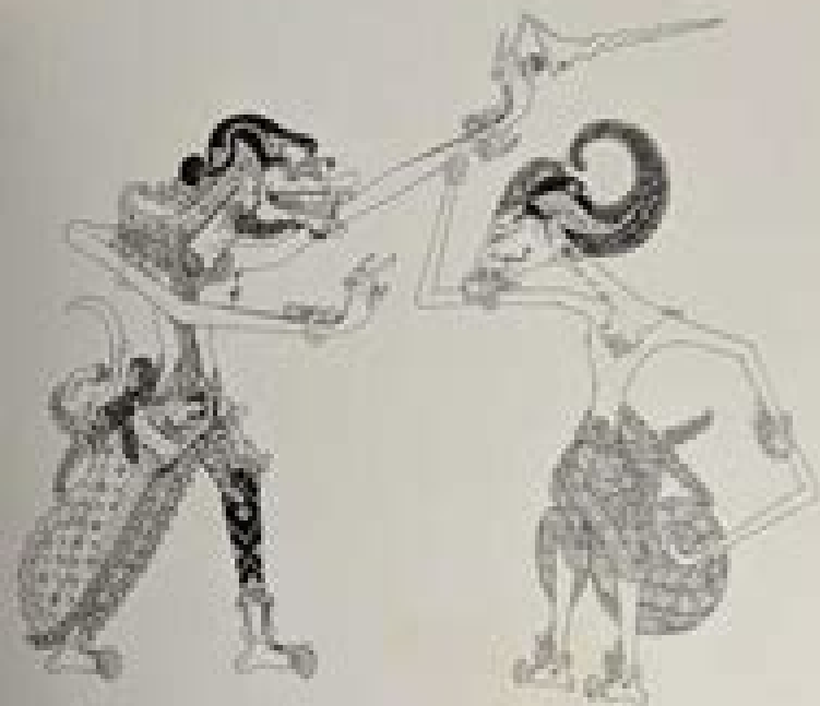
Below: a line drawing by Soekarno from 1945. The puppet is shown fighting the evil Gajah. Below: a drawing by Soekarno from 1945. The puppet is shown fighting the evil Gajah.