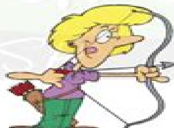
TIRO CON ARCO