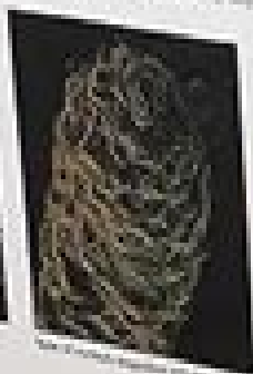
Micrograph of a seed or fruit structure.