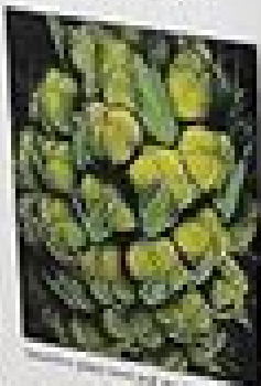
Micrograph of an insect or plant part.

How to Use This Book: This book is designed to be used in a variety of ways. It can be used as a reference book, a classroom resource, or a home entertainment book. The book is divided into sections, each containing a micrograph and a description of the object. The descriptions are written in a way that is easy to read and understand. The book is also designed to be used as a teaching tool. Teachers can use the book to introduce students to the world of micrographs and to teach them about the structure and function of various objects. The book is also a great resource for parents who want to help their children learn about the world around them.