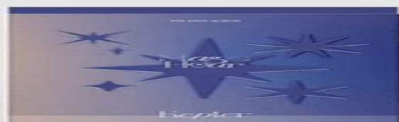
SLEEVE CASE 187.5×216mm