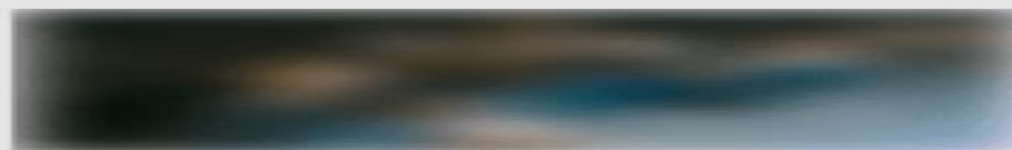
POSTER 296×428mm / 55×85mm