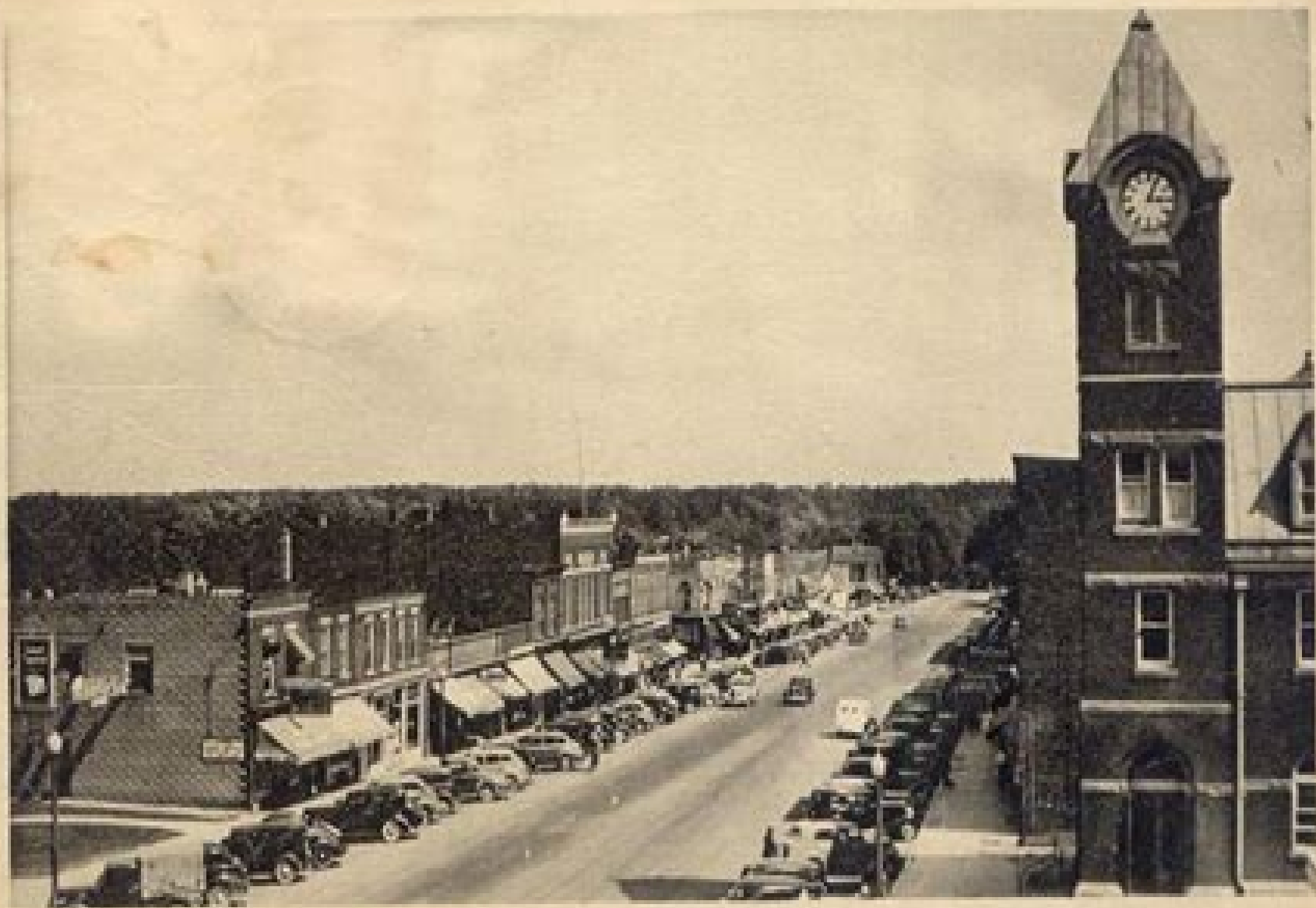
BROADWAY, TILLSONBURG, ONT.