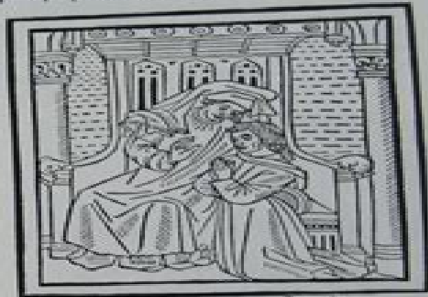
o homo furge qui deservit a il

Incipit eruditorium penitentie cuilibet christiano pernecessarium. obpenâsiore auctoritatis sacre scripture insignium.