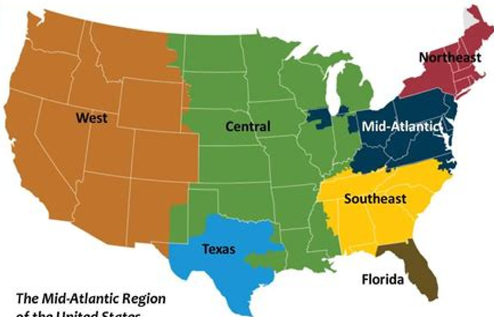
The Mid-Atlantic Region of the United States