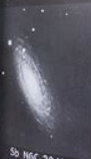
5b NGC 2845