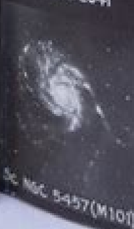
Se No. 5457(M101)