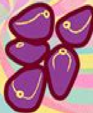
Morning glory seeds