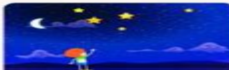
Twinkle Twinkle Little Star