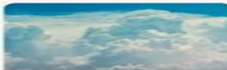
About My Dreams