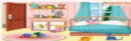
Bed in Summer