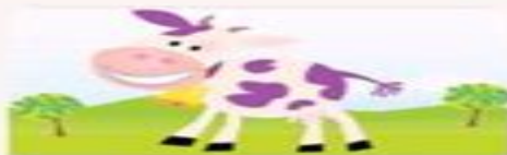
The Purple Cow