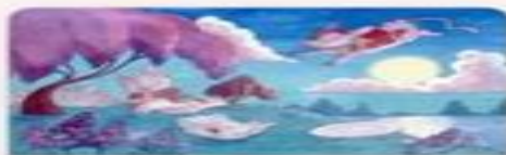
Hey Diddle Diddle