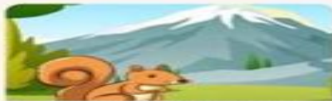
The Mountain and the Squirrel