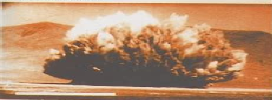
TIME = H + 4.0 sec.