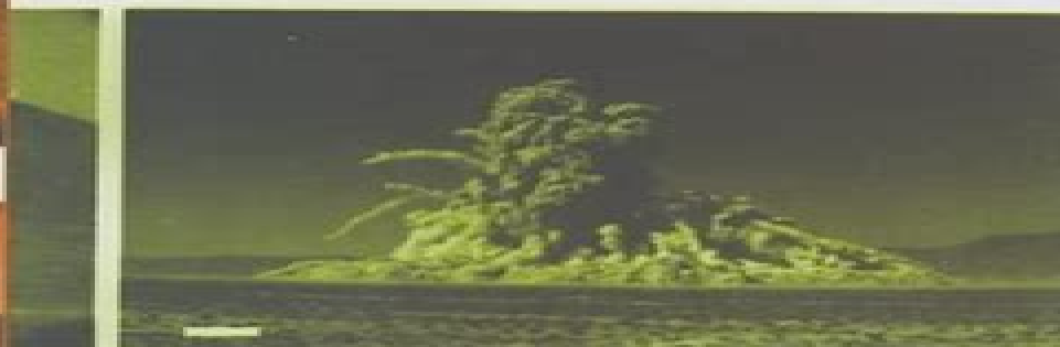
5. TIME = H + 39 sec.