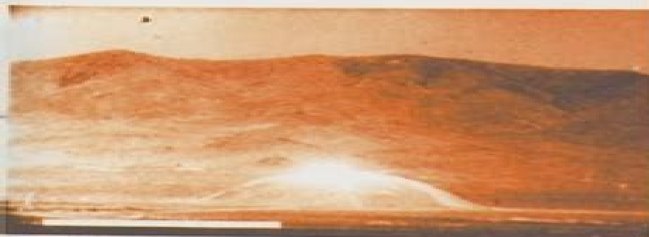
2. TIME = H + 2.8 sec.