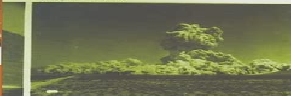
6. TIME = H + 6 min.