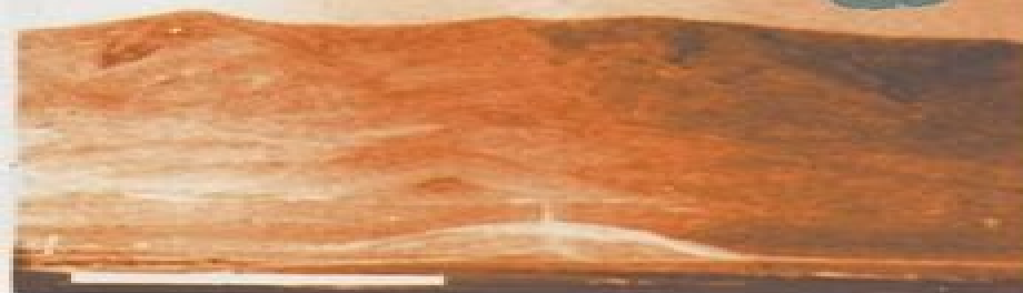
1. TIME = H + 1.9 sec.

Project Plowshare and the Unrealized Dream of Nuclear Earthmoving