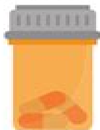
Over-the-counter pain relievers