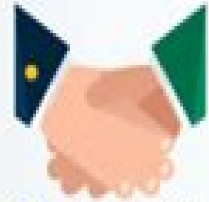
The Trade War