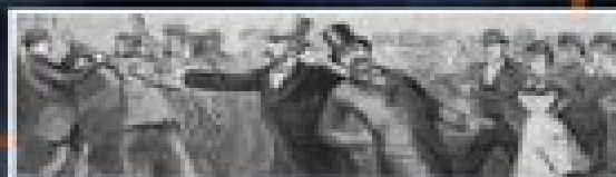
JULY 2 President James Garfield shot He died 2 months later