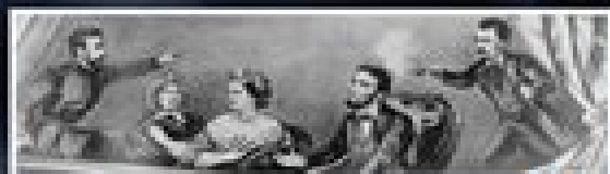
APRIL 14 President Abraham Lincoln assassinated