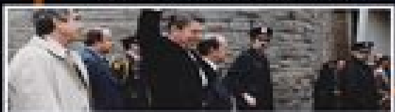
MARCH 30 Attempted assassination of President Ronald Reagan