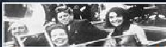
NOVEMBER 1 Attempted assassination of President Harry Truman