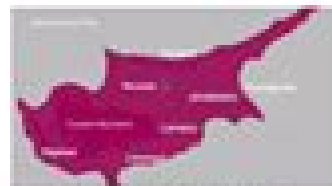
Fig. 1. Map of Cyprus marked with Athienou