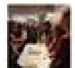
Fig. 6. Members of the community examining excavated artifacts

This event in particular embodied the work of AAP and its influence in the community. Looting has altogether ceased in the area because of the environment that the project has created, where locals can learn and feel a connection to their past. While the project of course benefits from research and excavation in the region, ultimately it is the members of the Athienou community that benefit most from the site.