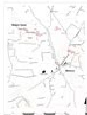
Fig. 3. Map of the Malloura area with labeled burial sites

A major issue that affects archaeological sites around the world is looting, which not only physically destroys sites but also greatly hinders the work of archaeologists who can no longer learn from those unprovenanced objects that end up on or in the art market. Reasons for the prevalence of looting in certain areas include economic hardship in the local community, active conflict in the surrounding region, and a demand for specific types of archaeological material in the art market.