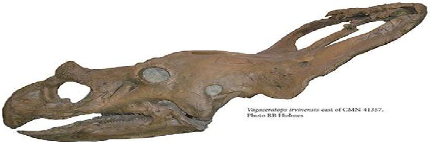
Vagaceratops irrisensis cast of CMN 41357.